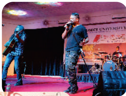
Lagori Band Performance during Pustak yatra 2019 at AISECT University