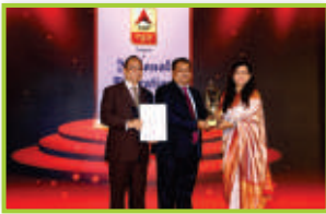
National Education Award for Most Innovative Private University 2019