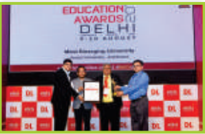
World Education Award for Most Emerging University 2019