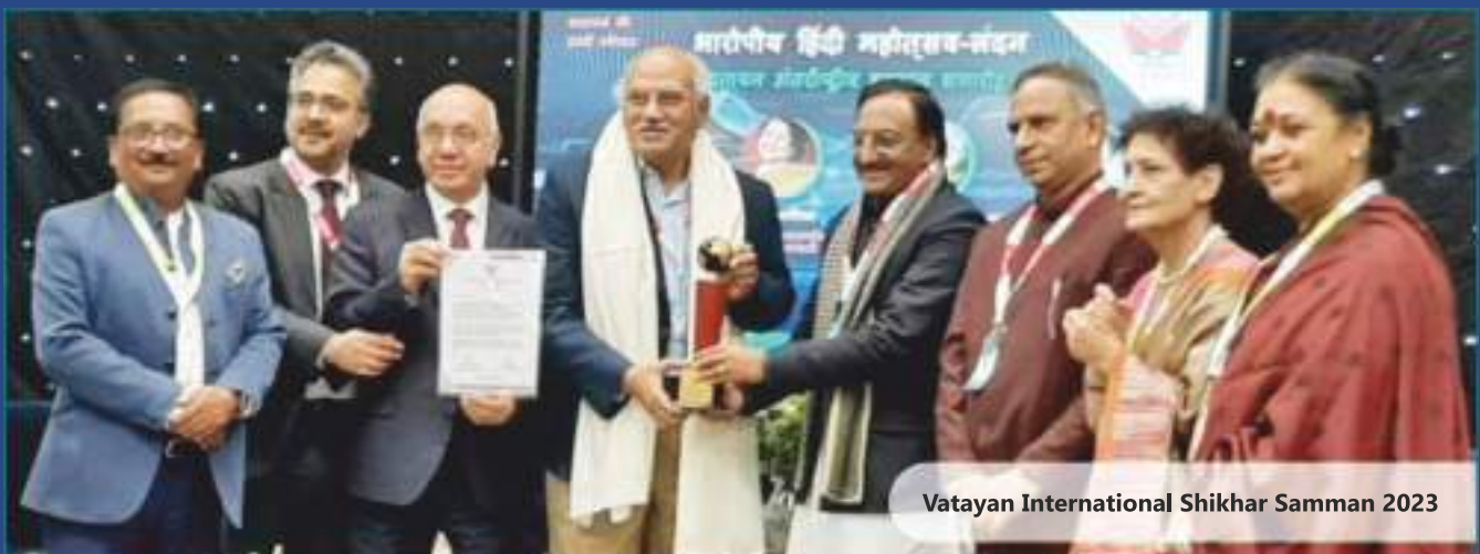
Vatayan International Shikhar Samman 2023