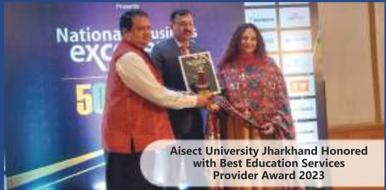
Aisect University Jharkhand Honored with Best Education Services Provider Award 2023