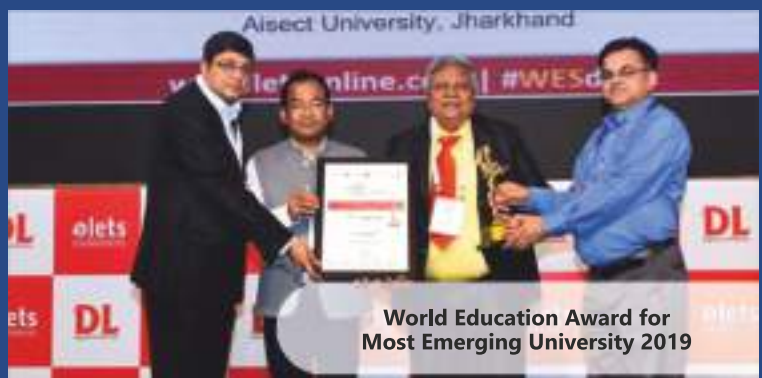
World Education Award for Most Emerging University 2019