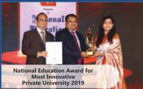
National Education Award for Most Innovative Private University 2019