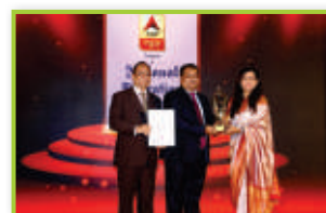
National Education Award for Most Innovative Private University 2019