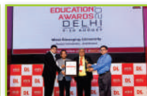
World Education Award for Most Emerging University 2019